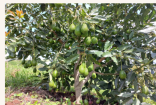
READY FOR HARVEST