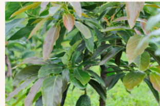
PLANTLET IN THE FIELD